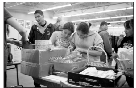
Participants prepare to deposit their tickets for one of the draws.

An old-fashioned popcorn machine added to the carnival-like fun. Manning this attraction were student volunteers and members of the Ambassadors in their orange uniforms. Young and old enjoyed the delicious snack as they wandered throughout the displays. Native Women's Transition Centre provided food at the canteen. One of those attending summed up the experience, "I thought the Fair was fun!"