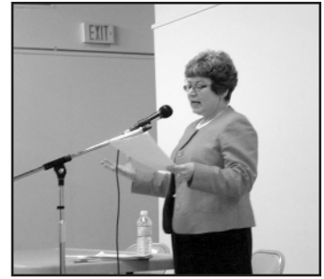
Judy Wasylycia-Leis, MP Winnipeg North Centre bringing greetings to the NECRC AGM.