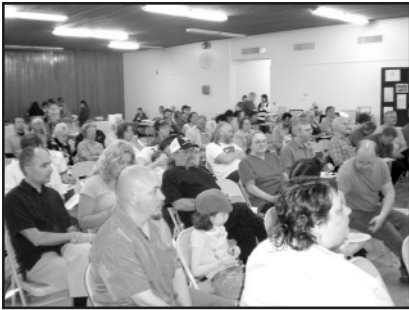
NECRC 2007 AGM

The North End Community Renewal Corporation (NECRC) held its 2006 Annual General Meeting (AGM) on Thursday April 26th at David Livingstone Community School. The AGM was attended by over 74 North End stakeholders.